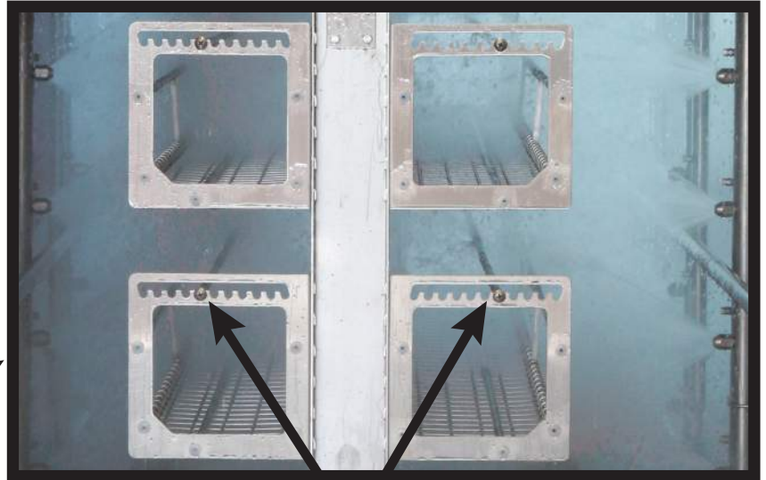
Adjustable retainer bar to accommodate a variety of cage, filtertop, debris pan, and accessory sizes.